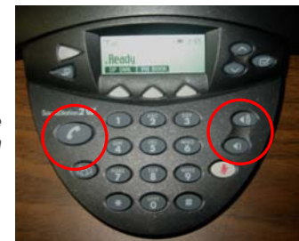
Volume Up / Down Buttons